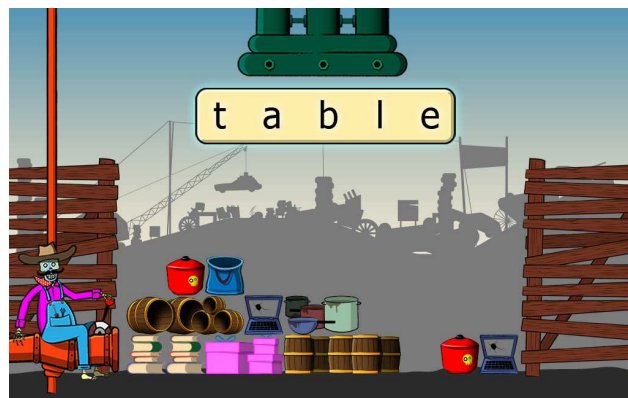
(b) Game activity example: Solomon’s junkyard